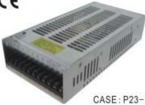
CASE : P23-3